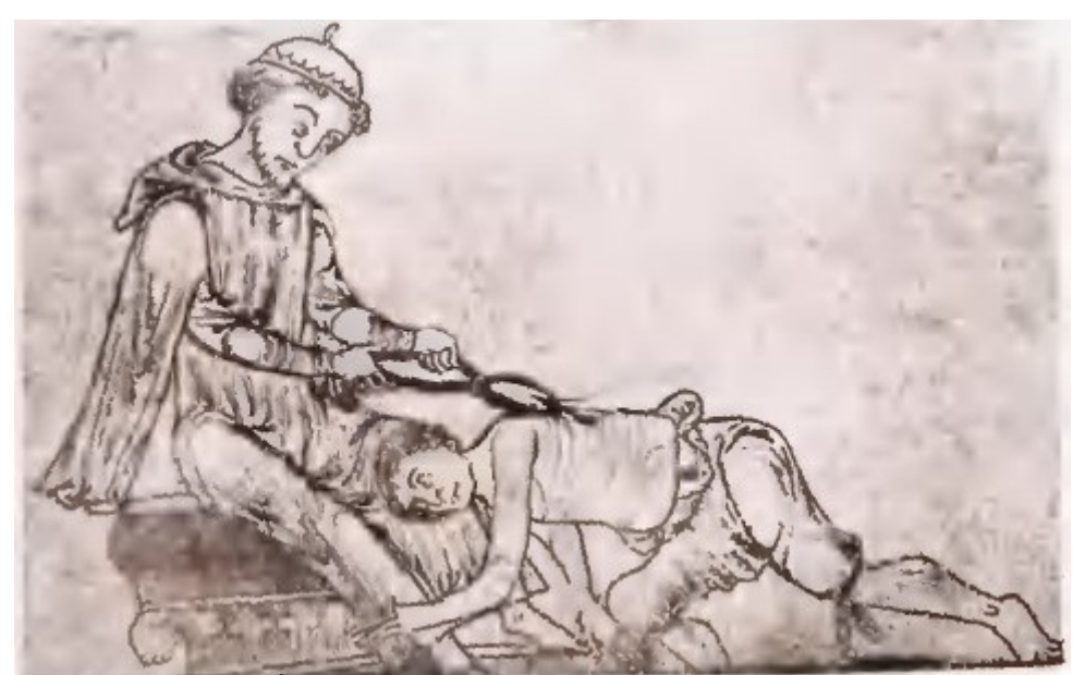
Picture 3: A 13<sup>th</sup> Century illustration of Roger Frugard (c1140 – c.1195) removing a barbed arrow

The famous illustration of Roger Frugard removing an arrow (below) shows a barbed arrowhead, although it could be argued this is artistic license.