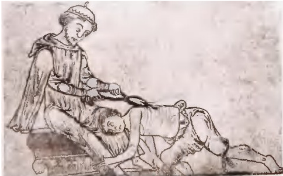
Picture 3: A 13 th Century illustration of Roger Frugard (c1140 – c.1195) removing a barbed arrow

The famous illustration of Roger Frugard removing an arrow (below) shows a barbed arrowhead, although it could be argued this is artistic license.